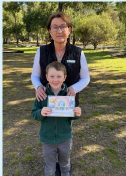
Infants Student of the Fortnight