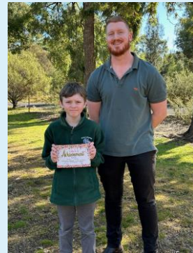
Primary Student of the Fortnight